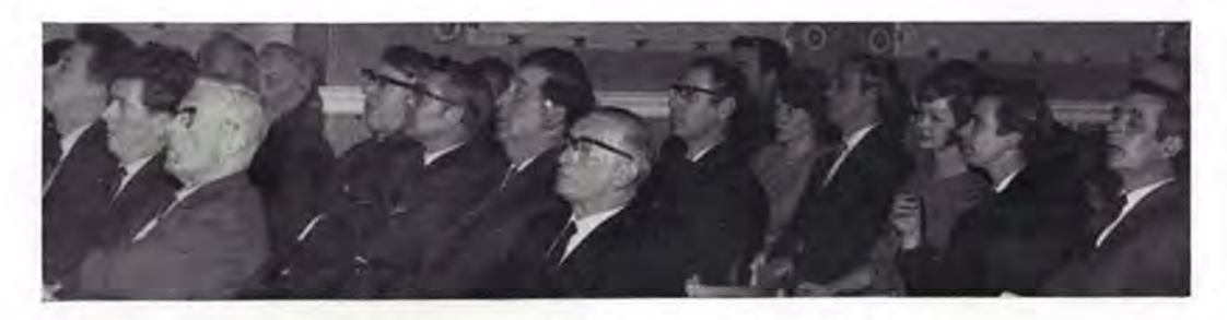
Sections of the interested audience at the Wrexham Conference.