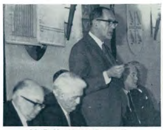
Mr. Dodds addresses the assembly.