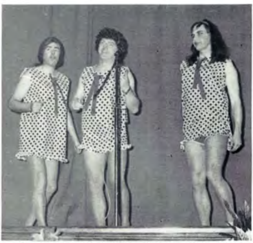
The "Not-so-Dusty Sisters" during their close harmony singing act. The 38-45-38 girlies attracted much attention.